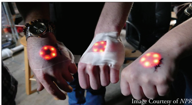
Body hackers displaying their Northstar LED light implants.

In February 2016, the world's first "BodyHacking Con" took place at the Austin Convention Center in Texas, where several hundred body hackers gathered to share their mission to improve the human body through implantable technologies. At the convention, body hackers lined up to receive implantable radio frequency identification chip devices, called RFIDs, that have encrypted information to open doors or contact personal smartphones. Others opted for more visible gadgets, such as the Northstar, which is implanted into the hand through a gory procedure and mimics bioluminescence when its five LED lights flash in response to a magnet (Peralta 2016).